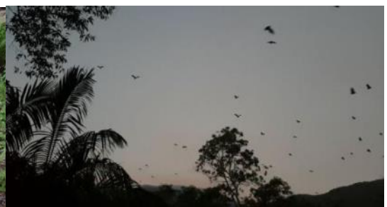
(Left) View at the end of the tour (Middle) Enjoying evening meal (Right) Flying foxes flying out at dusk