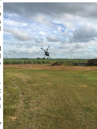
Feral Pig controlled in cane; Helicopter taking off