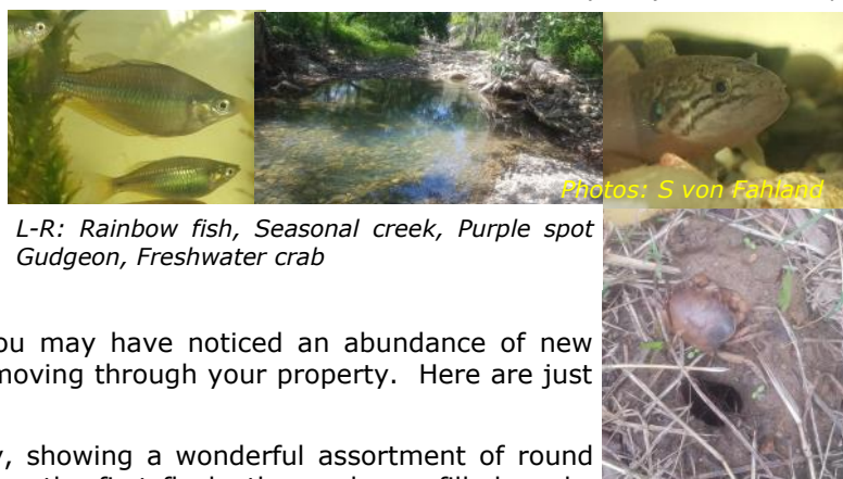
L-R: Rainbow fish, Seasonal creek, Purple spot Gudgeon, Freshwater crab

Information adapted from Tropical topics Newsletter article 2011 and personal observations.