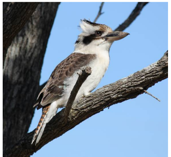
Photo 4: Kookaburra perched in a red bottle brush tree surveying its feeding grounds at the Sarina Community Native Gardens