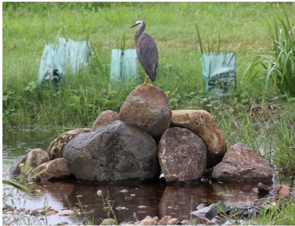
Photo 1: Adult White-faced Heron feeding at the seasonal wetland in the Sarina Community Native Gardens