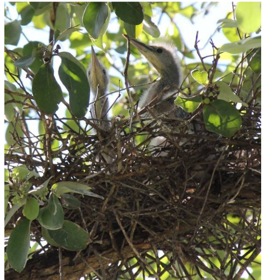
Photo 2: White-faced Heron chicks at the the Sarina Community Native Gardens