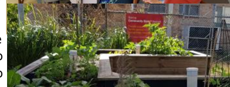
Above: Seed collecting Middle: Enjoying a cuppa! Below: Food garden growing strong