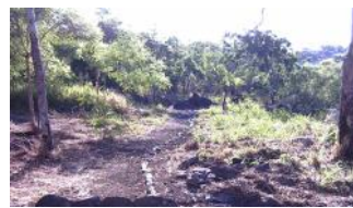
Sarina Inlet Trail, 2005 under construction and opening