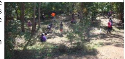
Below: Alligator Ck students planting in their bushland