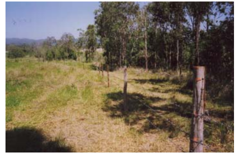
Fence to protect remnant vegetation

June 2008 saw the completion of the Sustainable Landscapes Program, an incentive based program that offered funds to land managers to implement a range of best management activities to assist in protecting and improving the condition of our natural resources.