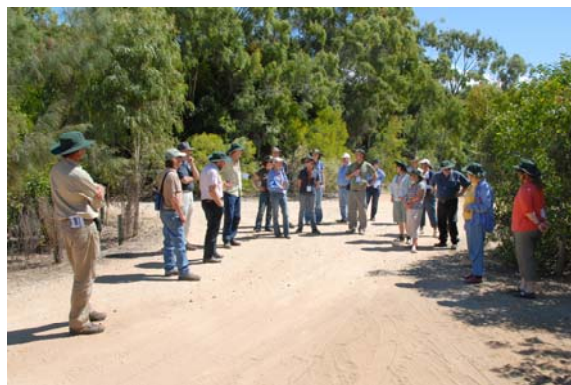
Sarina Coastal Field Trip