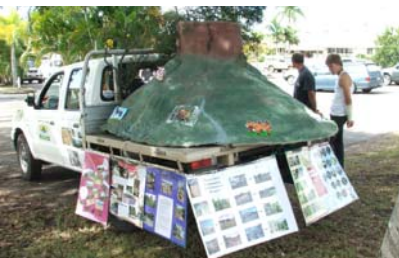
SLCMA Display—Discover Sarina Week