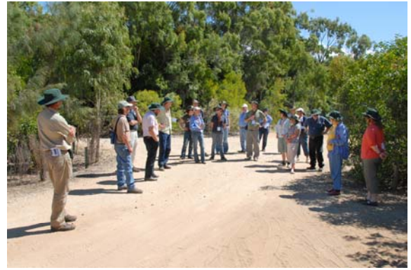
Sarina Coastal Field Trip