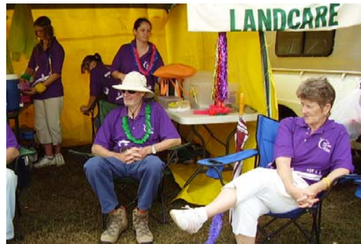
Above: SLCMA team—Relay for Life event Below: SLCMA Display at the Sarina Show