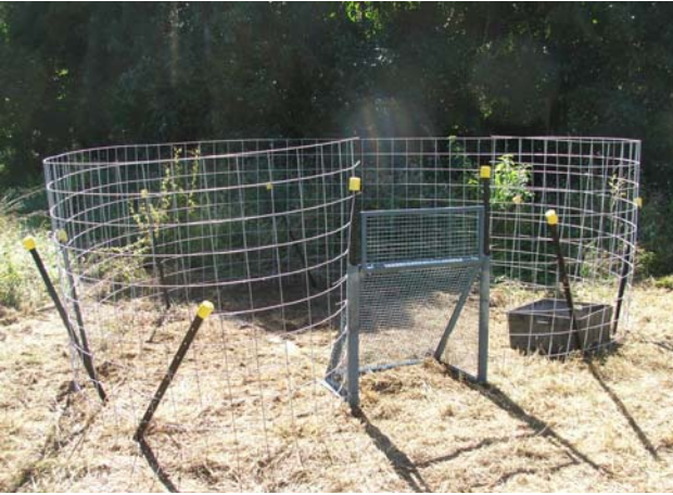
Pig trap on loan through Rocky Dam Creek Coordinated Feral Pig Project

Pests A weed identification & control stand was provided at Mitre 10 in Sarina and also at Rogers Rural Open Day & BSES Field Day. We have taken the initiative in Lantana control by purchasing a splatter gun for hire to locals for its control. This gas operated machine is small enough for able bodied farm managers to use in rough country.