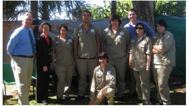
Sarina Green Corps team launch, Jul 08 to Jan 09

the community in high priority conservation projects as well as providing training & employment opportunities for our local youth. SLCMA would like to wish the team all the best throughout their 6 months and would like to extend their thanks to all of our project partners, for their ongoing support towards the Green Corps program. SLCMA has submitted an application for a new Green Corps team & if successful will begin in early 09.