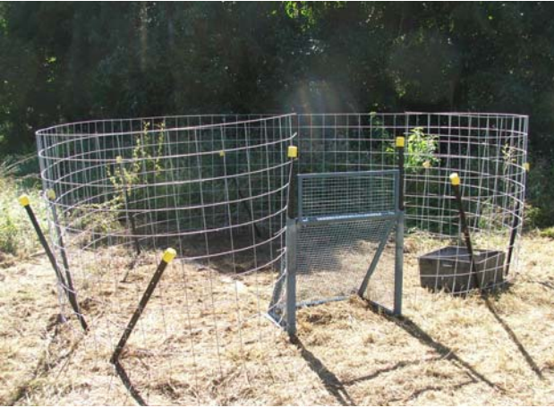
Pig trap on loan through Rocky Dam Creek Coordinated Feral Pig Project

Pests A weed identification & control stand was provided at Mitre 10 in Sarina and also at Rogers Rural Open Day & BSES Field Day. We have taken the initiative in Lantana control by purchasing a splatter gun for hire to locals for its control. This gas operated machine is small enough for able bodied farm managers to use in rough country.