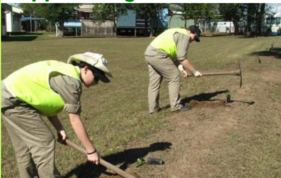
Green Corps helping Alligator Creek School establish native shade plants around the school grounds

SLCMA has been working with our local schools on a range of projects. This has included providing plants & advice to establish native plants around the school grounds—for shade as well as to attract native wildlife.