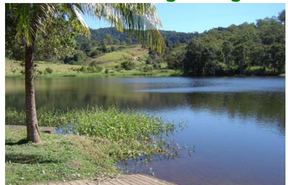
Middle Creek Dam, Plane Ck monitoring site—May 08

The data collected for each of the creeks has been collated & analysed by Natural Resources & Water, to compile the Ambient Monitoring Program Regional Report 2008 , which provide a summary of the results for each creek monitored. The data has helped to build our understanding of health of our catchment as well as being used to inform the development of the Mackay Whitsunday Water Quality Improvement Plan .