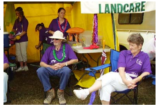
Above: SLCMA team—Relay for Life event Below: SLCMA Display at the Sarina Show