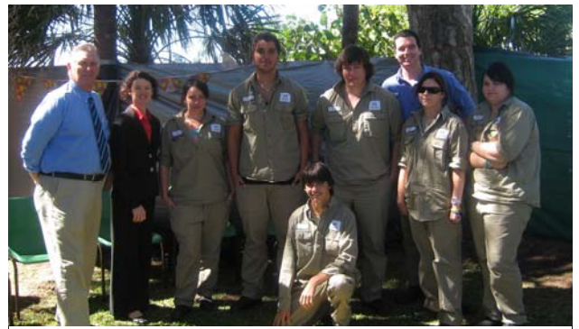
Sarina Green Corps team launch, Jul 08 to Jan 09

the community in high priority conservation projects as well as providing training & employment opportunities for our local youth. SLCMA would like to wish the team all the best throughout their 6 months and would like to extend their thanks to all of our project partners, for their ongoing support towards the Green Corps program. SLCMA has submitted an application for a new Green Corps team & if successful will begin in early 09.