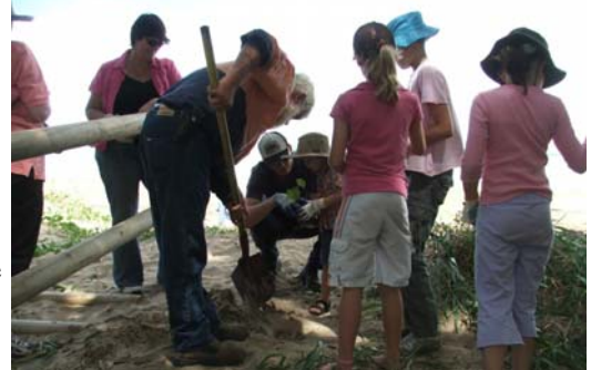
Armstrong Beach working bee—Coastcare Week