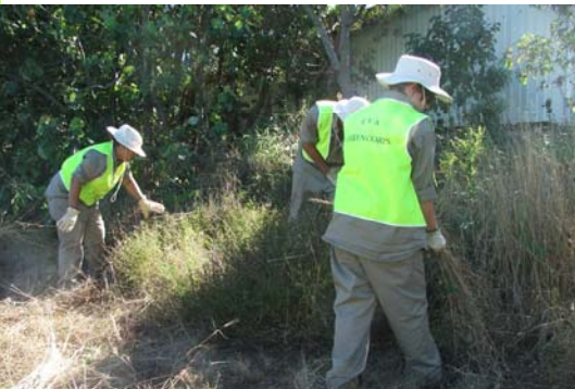
Weed control at Louisa Creek