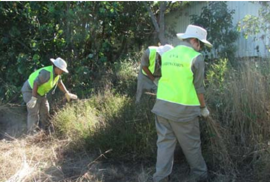
Weed control at Louisa Creek