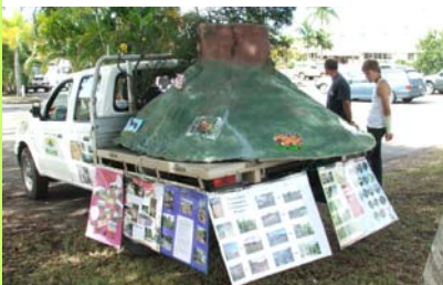
SLCMA Display—Discover Sarina Week