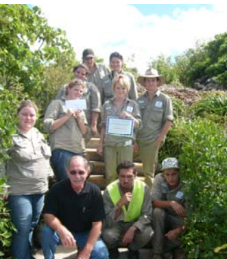
Sarina Green Corps #2, helped out at Captain Blackwood Drive

A big thank you to our project partners, who continue to show their support for our Green Corps teams. The current Green Corps Program as a youth training program, is now currently under review and it is suggested that the program will be continue into the future but will have a different focus.