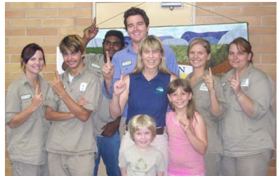
Sarina Green Corps #1, are congratulated by the Irwin Family, with a surprise morning tea, the day of their graduation!