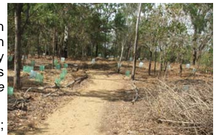
Walking trail, revegetation & weed control at Louisa Creek Reserve

SLCMA is working in partnership with the Coalport Community & Recreation Association to rehabilitate a section of the Louisa Creek Reserve and install an educational walking trail for locals and visitors. The project is supported by Mackay Regional Council, Sarina Green Corps, Conservation Volunteers Australia, the local community and compliments the Sarina Coastal Sustainable Landscapes Program .