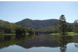
Middle Ck Dam: ambient monitoring site May 2009

This project is a partnership between Mackay Regional Council, Central QLD University, Sarina State High School—Rural Skills Centre, Reef Catchments Mackay Whitsunday, volunteers and local residents. The knowledge gained from this project has great potential to assist with the remediation of blue-green algae outbreaks in other local waterways such as small farm dams and other hot spots.