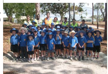
Sarina Green Corps help out Carmila School to create an educational rainforest area