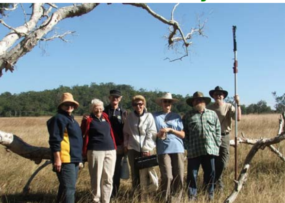
Volunteers seed collecting field trip along Bells Creek

The number of volunteers seems to be growing as we speak! Each week there are new faces at our volunteer mornings who are keen to learn new skills and what better place than our community nursery!