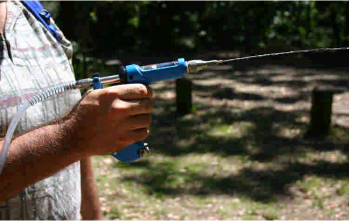
Manual splatter gun.