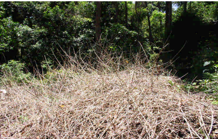
Lantana 2 months after treatment with glyphosate applied using the splatter gun.